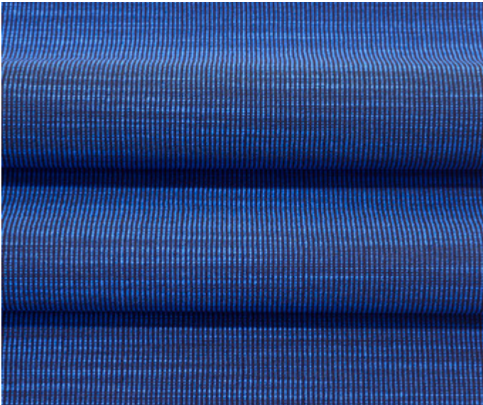
Raas 92% new wool, worsted, 8% nylon 140 cm wide 29 colourways